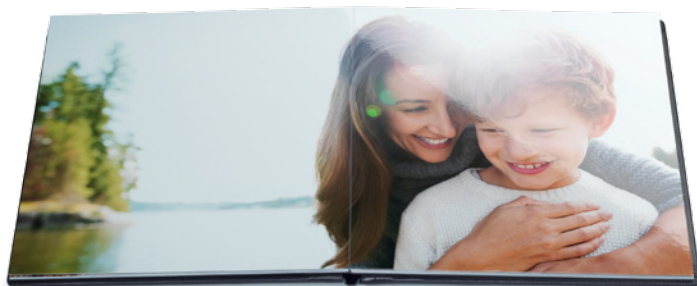
Photo albums in various sizes and outstanding thickness