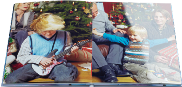
Photo albums in various sizes and outstanding thickness